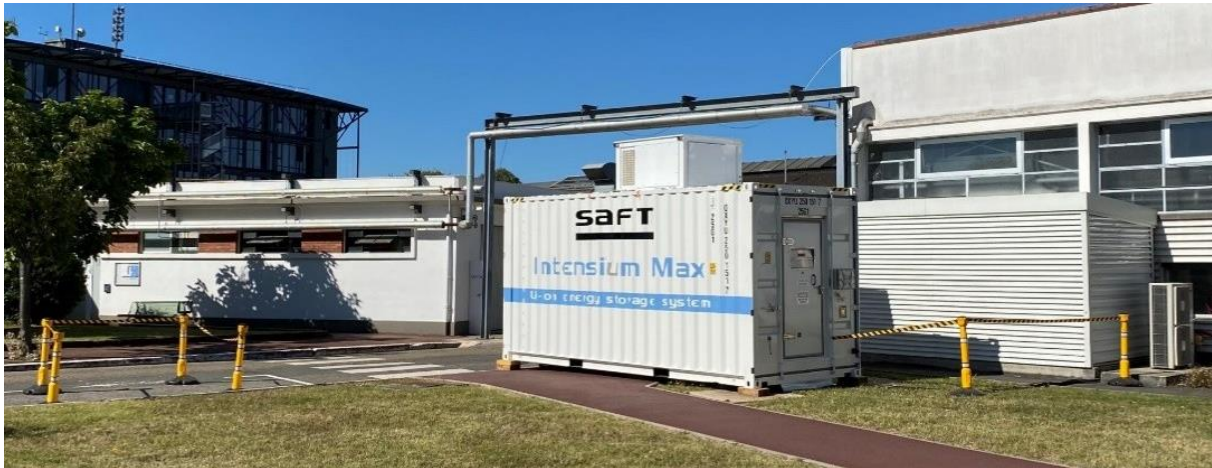
Figure 1 : SAFT High Voltage Lithium-Ion battery for WP4 demonstrator

In the meantime, scope-of-work for installation of the demo has been defined under CENER's leadership and in collaboration with all partners. The company responsible for installation has been already selected. On field installation works are planned for August-September 2021.