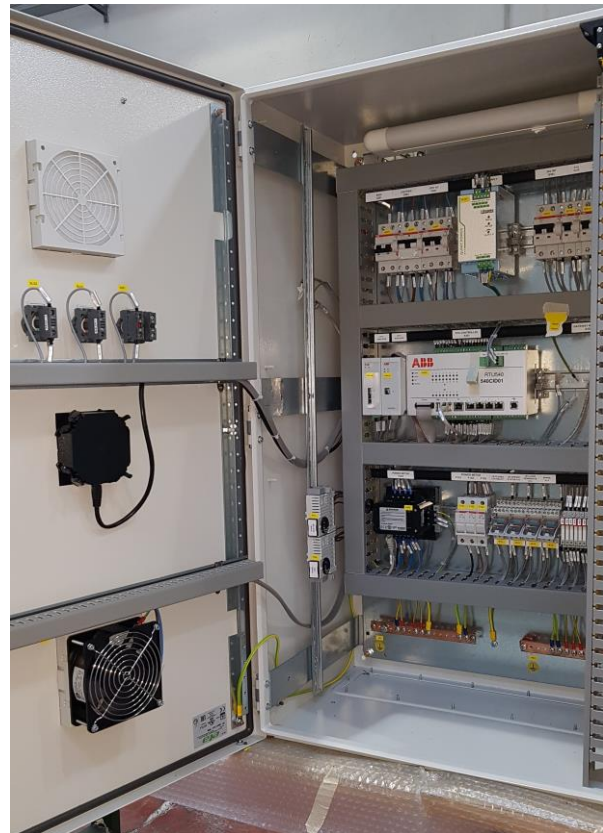
Figure 2 : Communications for congestion management with industrial sites (left); Local control unit installed by ABB in one of the sites (right)

With regards to the participation of the wind parks to Automatic Voltage Control , the Vaglio plant has started the experimentation phase with the first local tests addressing the primary regulation with Q set-points locally sent, according to a test specification elaborated by Terna. These tests are aimed to address both the static and dynamic capability of the plant in providing the requested reactive power. The remote test planned afterwards will involve the TSO control rooms. The Pietragalla plant is now ready also for the communication tests and the experimentation will begin with local tests.